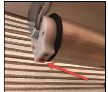
Reset Button – Natural Woven