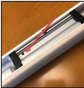
Reset Button – Honeycomb